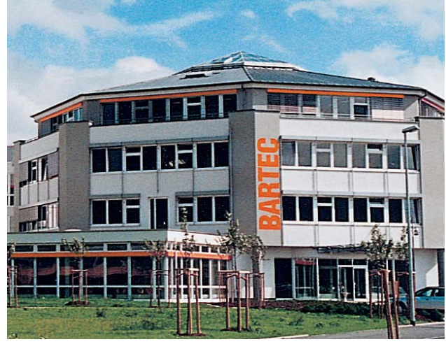
Head office of BARTEC in Bad Mergentheim