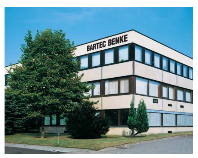
Company location in Reinbek near Hamburg

This is guaranteed by our regional specialist teams, as well as 20 market divisions and more than 30 specialist representatives of the BARTEC group throughout the world.