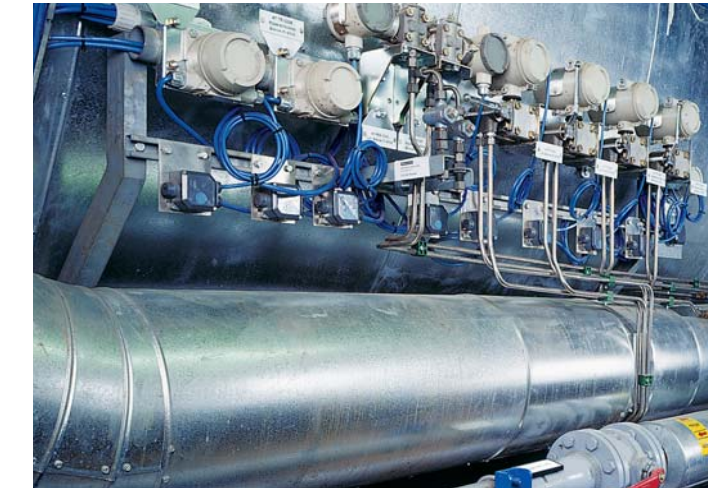
Analyzers and Analyzer Systems